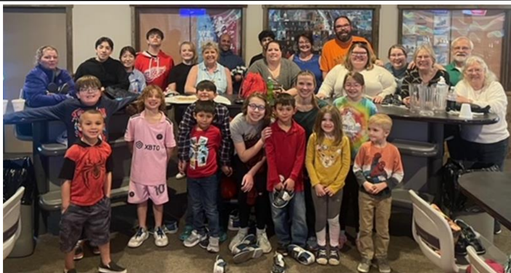
FUN BOWLING FELLOWSHIP! It was a great afternoon! (March 3)