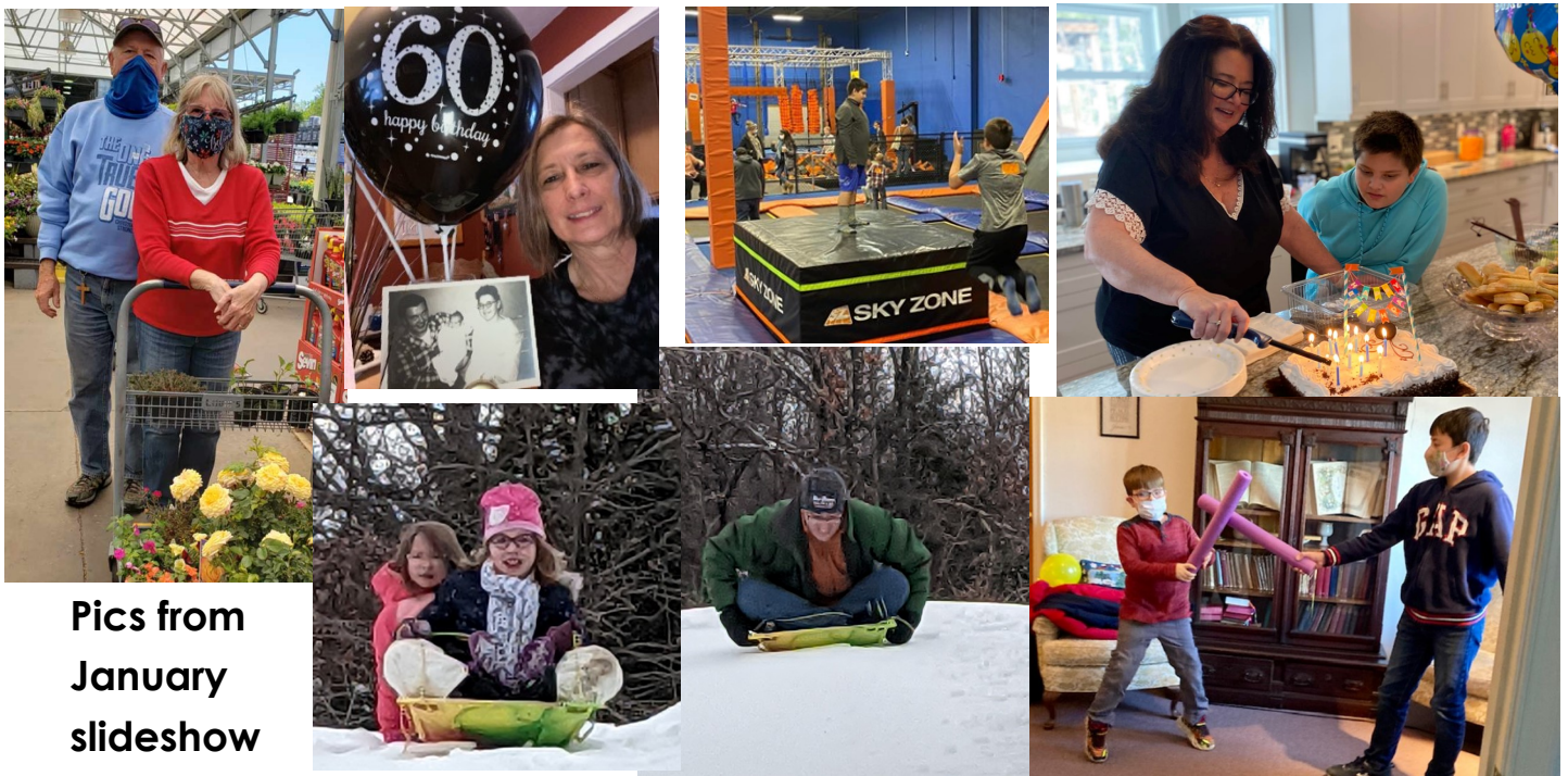
Pics from January slideshow