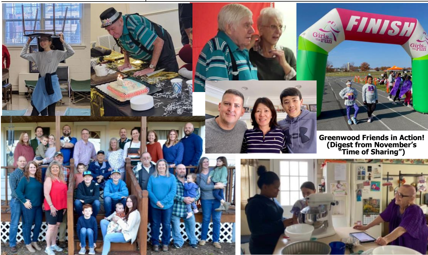
Greenwood Friends in Action! (Digest from November's "Time of Sharing")